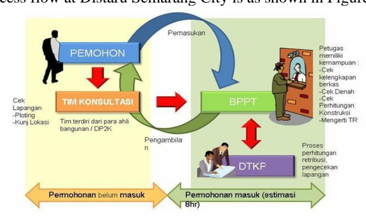
Figure 1 IMB Permit Service Process Flow The IMB permit service process flow at Distaru Semarang City is as shown in Figure 1 below