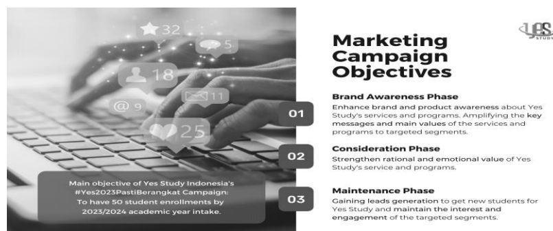
Figure 4 Marketing Campaign Objectives

For Instagram and TikTok, content should be post up every day, while for YouTube, the company can start by uploading content every month.