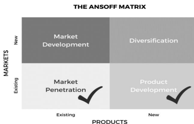
Figure 3 The Ansoff Matrix

The Ansoff Matrix helps to guide the company in the direction for growth that aligned with the strategy formulation (Hussain et al., 2013; Loredana, 2017). Yes Study Indonesia can apply the Market Penetration and Product Development strategies to help them achieve the set business objectives. Detail of each marketing initiatives involved in each strategy that being pulled from the SWOT Matrix would be discussed in the STP and Service Marketing Mix (7Ps) as stated in the parentheses.