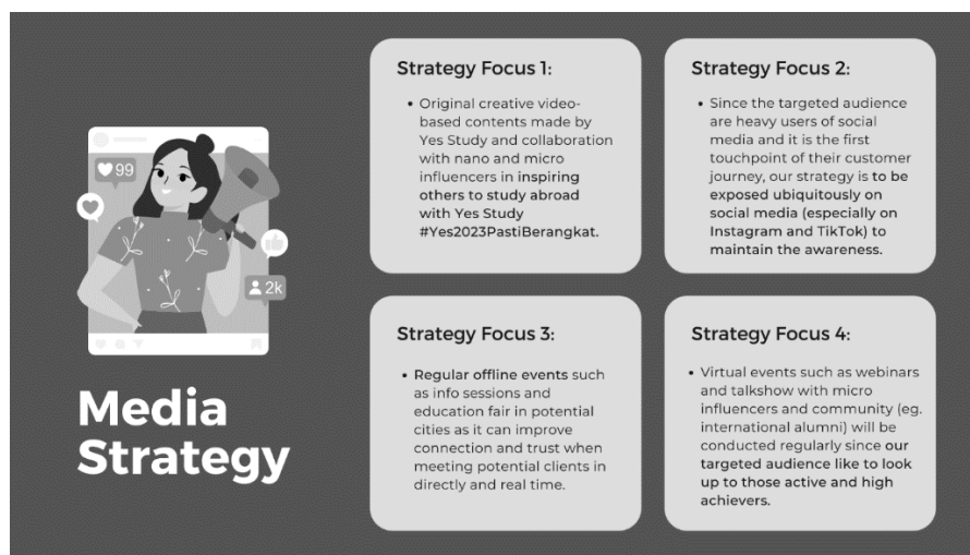
Figure 5 Media Strategy

Event marketing is also essential for generating leads, such as education expo and info sessions, online and offline. Online sessions can be done monthly, while offline sessions can be held once every three months or per quarter. Road show event is also encouraged for Yes Study Indonesia to get to other potential cities and customers.