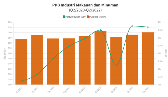
Figure 1. Gross Domestic Product Food and Beverages Industry Quarter 2nd 2020 – Quarter 2nd 2022

When covid-19 took place, almost all businesses suffered various losses, including the food business. With the decline in business activities due to the implementation of travel restrictions and lockdowns at the start of the pandemic, many restaurants, cafes, and food stalls were forced to temporarily close as a measure to limit the movement and spread of the virus (Kusuma, 2020). This resulted in a sharp drop in revenue as many restaurants had to find ways to survive.