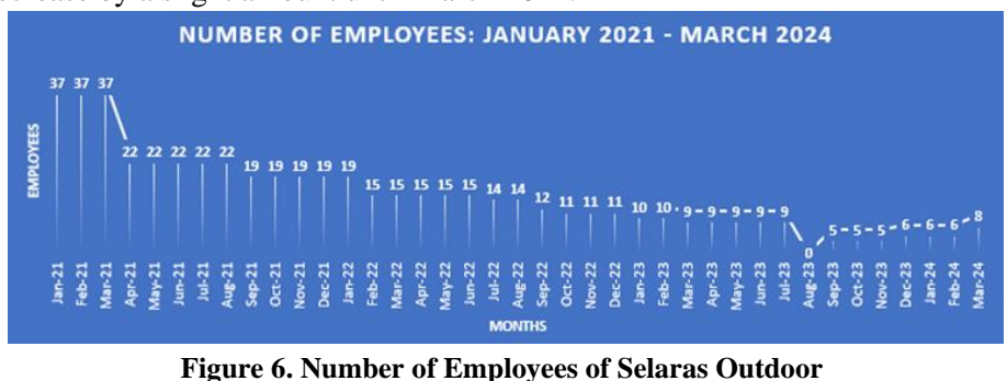
Figure 6. Number of Employees of Selaras Outdoor

Looking at the revenue data owned by Selaras Outdoor in the first year, revenue fell in the sixth month and again had a similar amount at the end of the first year. In the second year, 2022, the amount of revenue fluctuates but the difference between the first month and the last month is quite far. In the third year, due to the influence of the weather as well as the increasing influence of new food businesses, revenue fell greatly according to the graph below. There is no revenue in August 2023 because Selaras Outdoor is under renovation. The revenue continued to decline when it reopened but continued to increase and decrease by a slight amount until March 2024.