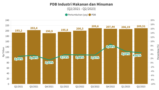
Figure 2. Gross Domestic Product Food and Beverages Industry Quarter 2nd 2021 – Quarter 2nd 2023

The pandemic took place in March 2020 so in the second quarter of the same year, the number of food businesses decreased dramatically. Looking at the graph above, the performance of the food and beverage industry tends to strengthen after experiencing a slowdown due to COVID-19 in the second quarter of 2022. It can be seen that the growth of the food and beverages industry developed over the quarter, as well as the gross domestic product of the industry, experienced fluctuations that were not so far away. This is influenced by the decline in exports of CPO or Crude Palm oil and cooking oil because it has a clear impact on the industrial sector (Rizaty, 2022).