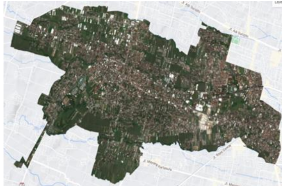
Figure 2. S2A Sentinel image (no scale).

encourages the heat of the surface in Kartasura District. The condition of Kartasura Subdistrict is in line with research conducted by (Rajkumar & Elangovan, 2020) Where green land is replaced by impermeable concrete covers and surfaces with high emissivity due to urbanization resulting in an increase in urban heat island. Measurements in Kartasura Subdistrict use S2A Sentinel imagery. An overview of sentinel imagery is presented in Figure 2.